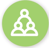
Multi-Tenancy & User Access