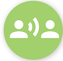
Secure Two-Way Communication