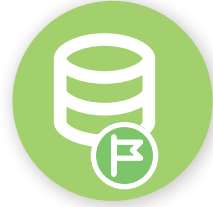
Delayed Data Flags